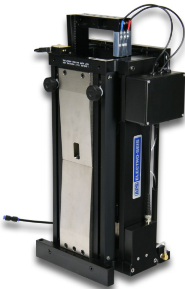
APS 113-AB with APS 0162 Vertical Mounting Kit

Acceleration performance of the APS 113-AB shaker with various mass loads is shown in the lower graph.