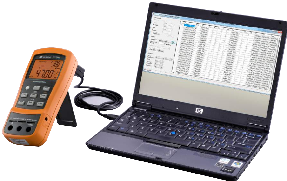
Figure 1. Automate the recording of continuous readings when you hook the U1731C/U1732C/U1733C to a PC

The handheld LCR meters allows you to test various component types, including secondary components of Dissipation Factor (D), Quality Factor (Q), and Angle Indication of Impedance ( \theta ). This new handheld series also includes other functions that result in a more detailed component analysis. For example, the built-in Equivalent Series Resistance (ESR) function helps you better understand the inherent resistance behavior typically found in capacitors across selected frequencies. DCR is a built-in DC resistance measurement that eliminates the use of a separate digital multimeter (DMM) for component test.