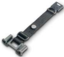
U1171A Magnetic Hanging Kit

For fastening of DMM to a steel surface so both hands are free.