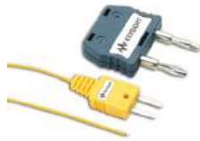
U1186A K-type Thermocouple and Adapter