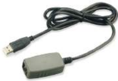
U1173A IR-to-USB Cable