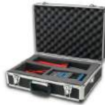
U1172A Transit Case (Aluminium-clad)