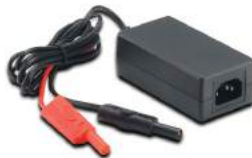
U1170A AC Adaptor