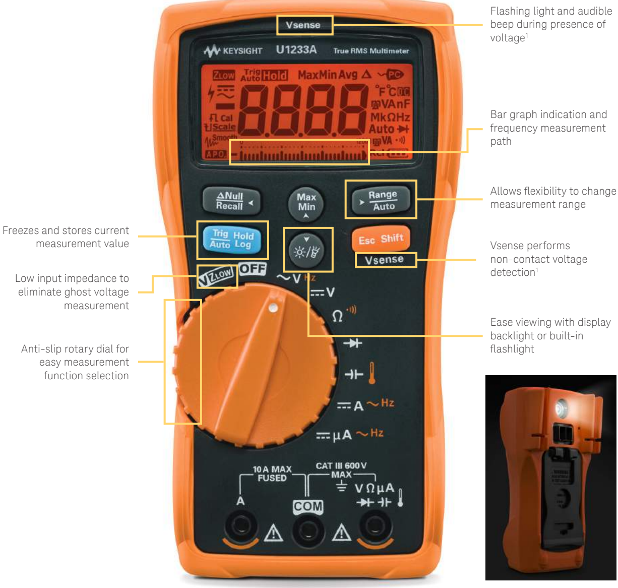
Figure 1. U1230 Series front view