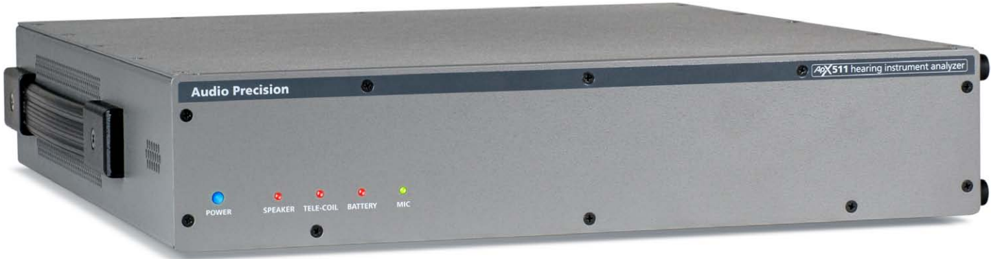
APx511 audio analyzer for hearing instrument production test